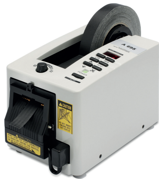
A695, A696, A697, A698

Depth 210 mm, width 135 mm, height 150 mm Weight: 2.7 kg