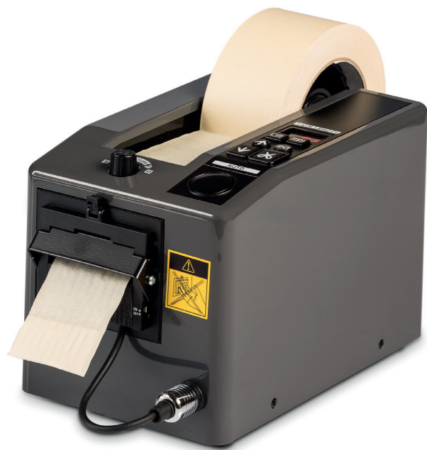
A 690N, A 691N

The tape length is programmable with five memory locations in millimetre increments. The device is equipped with a photoelectric cutting device as standard. The device A691N is suited for narrow tapes.